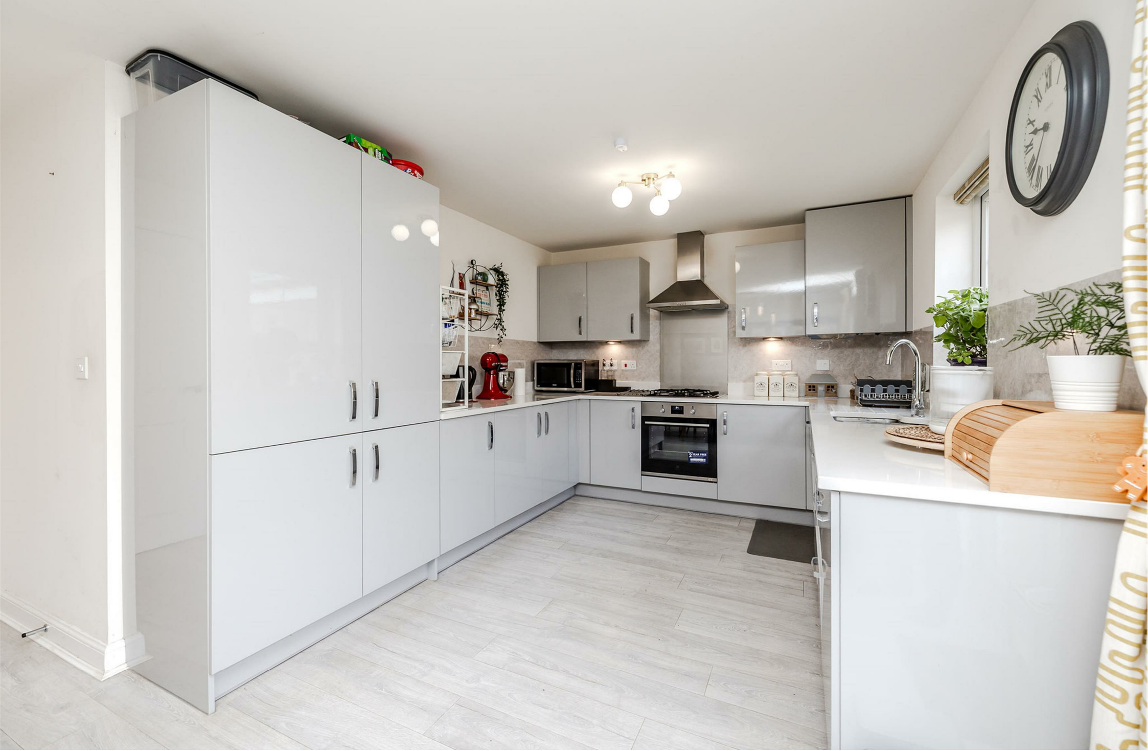
16 Buttercup Drive, Meadow Hill, Newcastle Upon Tyne, NE15 9FW