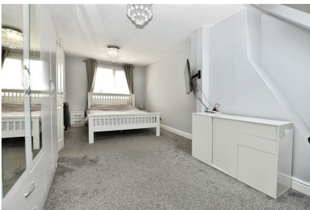
Master Bedroom 17'9 x 10'8 narrows to 8'11 (5.41m x 3.25m narrows to 2.72m)

This room was formally two bedrooms, with the doorway still in place to enable it to be converted