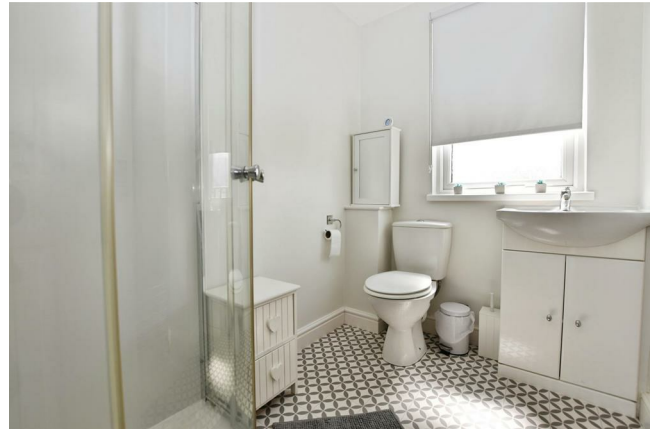
Shower Room 6'9 x 5'0 (2.06m x 1.52m)

With a walk in shower enclosure and mixer shower above, low flush toilet and vanity sink. Upvc double glazed window and central heating radiator.