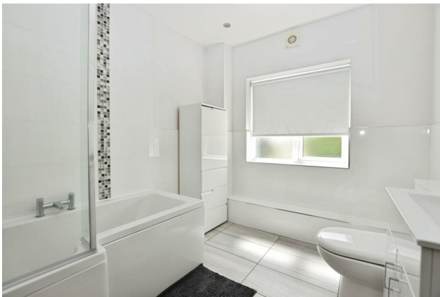
Bathroom 9'1 x 7'6 (2.77m x 2.29m)

Panelled bath, pedestal sink and a low flush toilet. Tiled walls and floor and a central heating radiator.