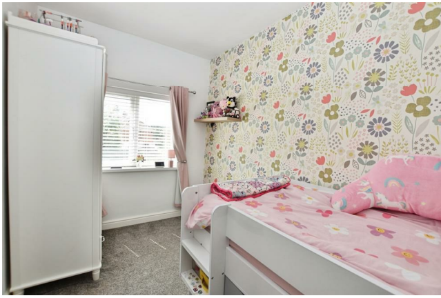
Bedroom Three 11'11 x 7'0 (3.63m x 2.13m)

Upvc double glazed window and central heating radiator