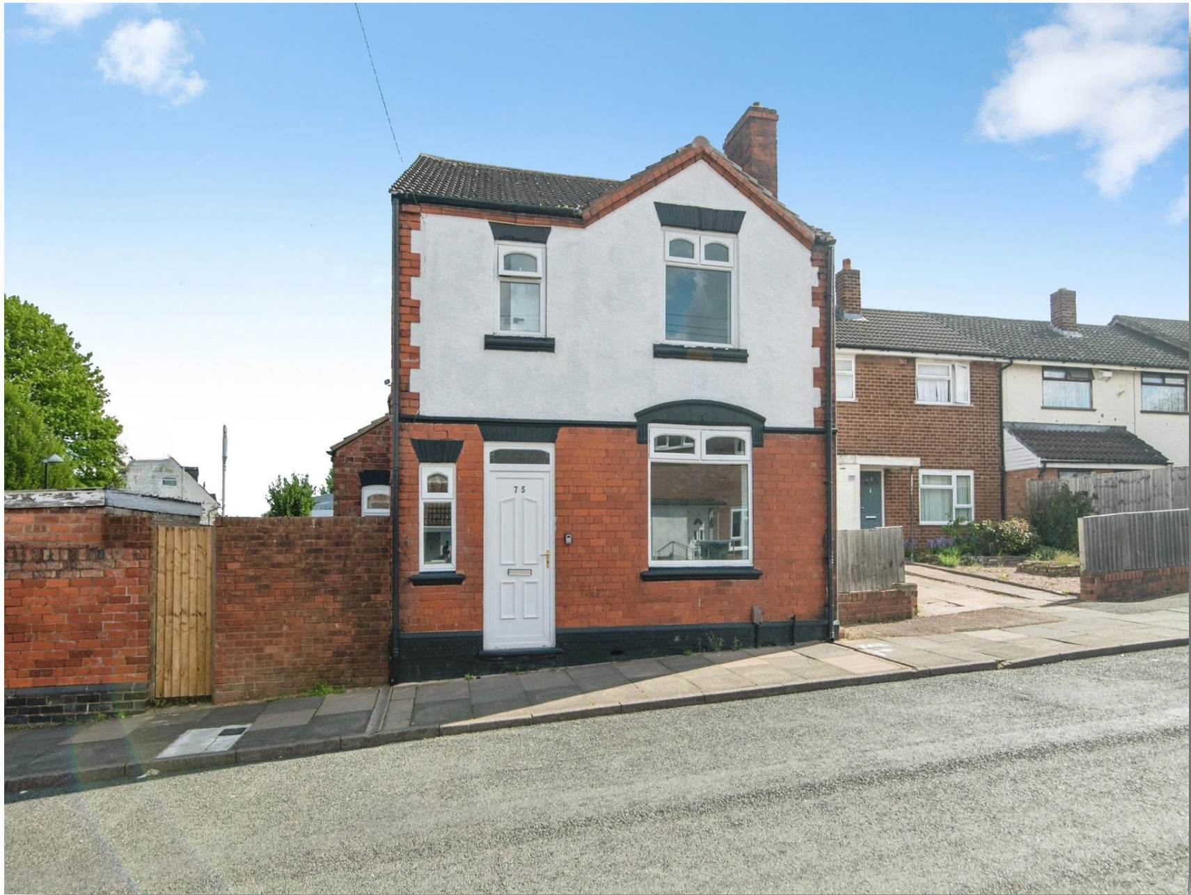
Cophall Street, Tipton DY4 7JG