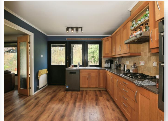
Svenskaby, Orton Wistow PETERBOROUGH PE2 6YZ