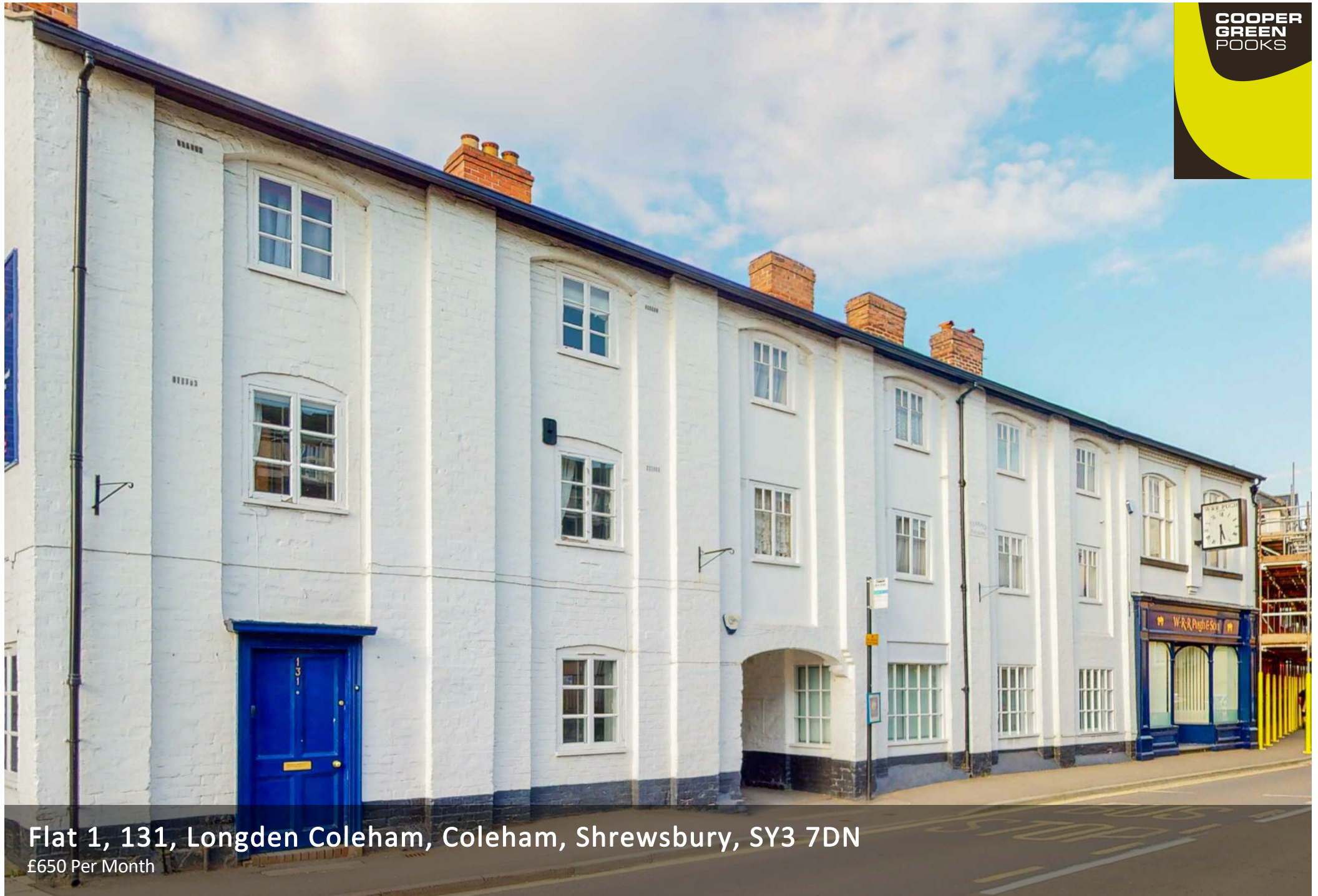
Flat 1, 131, Longden Coleham, Coleham, Shrewsbury, SY3 7DN £650 Per Month