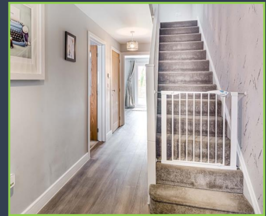
4 Bedroom Semi detached House £425,000 Freehold