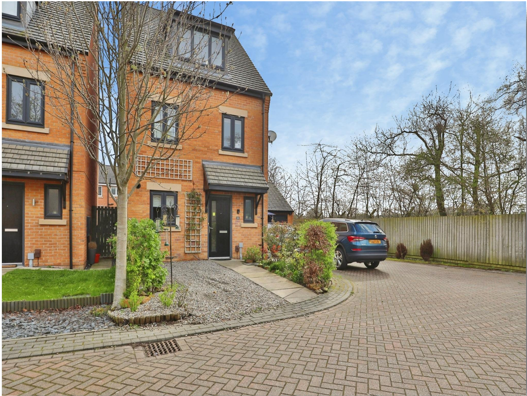
Elsie Bruce Grove, Crossgates LEEDS LS15 8FN