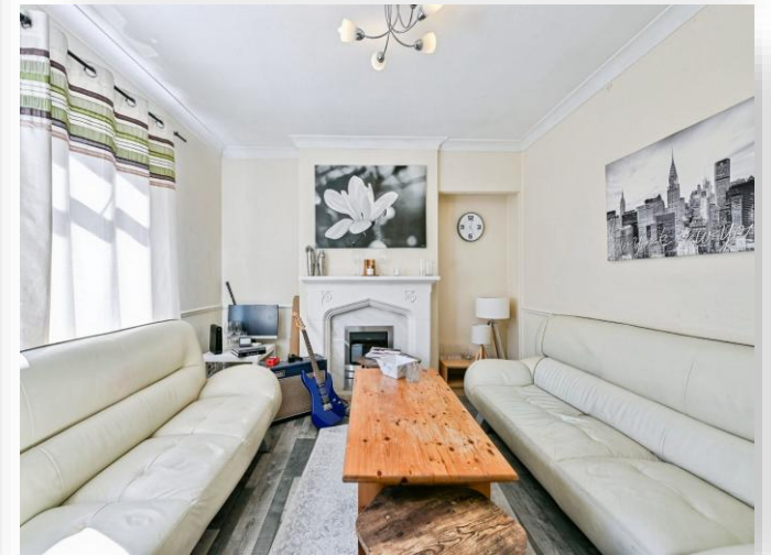
Fraser Road, Nottingham NG2 2JZ