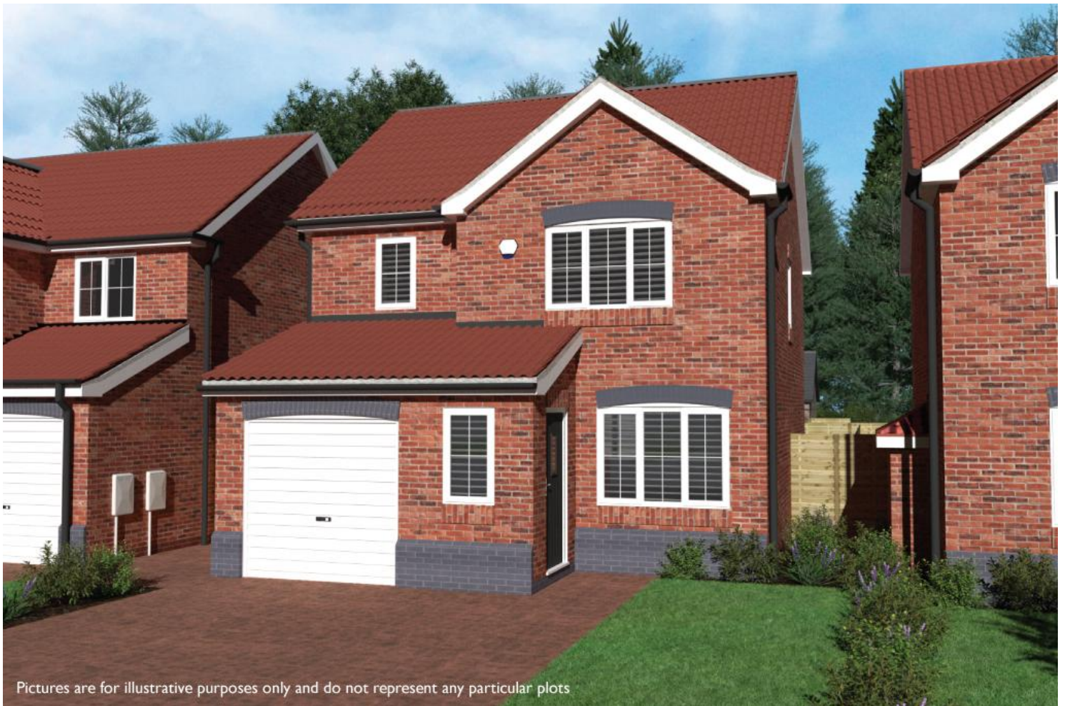
Pictures are for illustrative purposes only and do not represent any particular plots