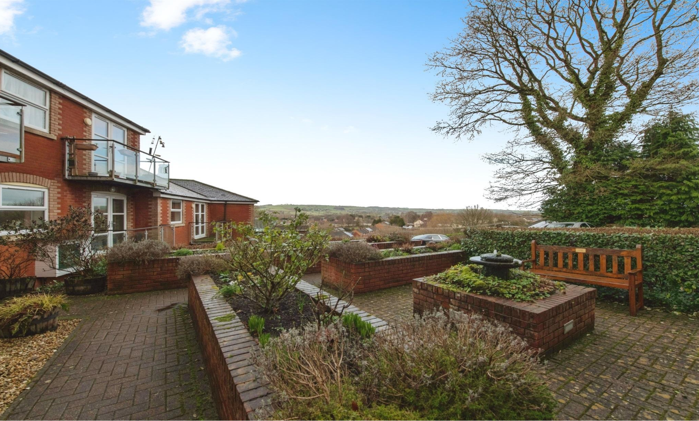
Fig Tree Court Canal Hill, Tiverton EX16 4JD