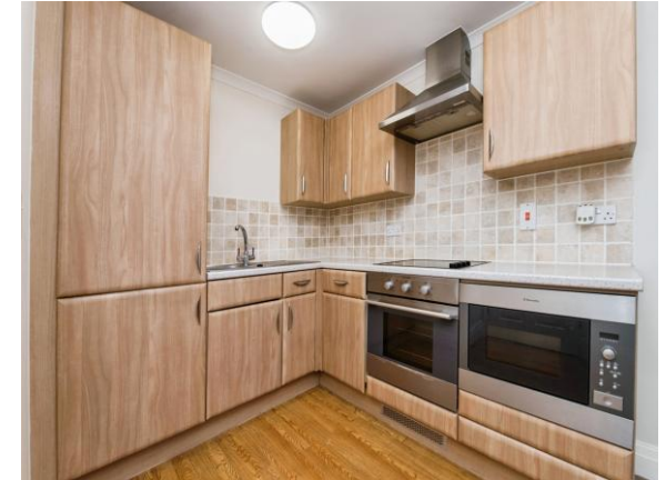
Fig Tree Court is a purpose built residential development to cater for the over 55's. There are 14 apartments in total. This apartments is one of the few that enjoys spectacular views over the Grand Western Canal and surrounding countryside. There are several well lit seating areas for use of the residents of these properties.