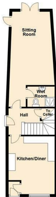
Ground Floor Approx. 42.4 sq. metres (456.2 sq. feet)

Total area: approx. 147.7 sq. metres (1589.9 sq. feet)