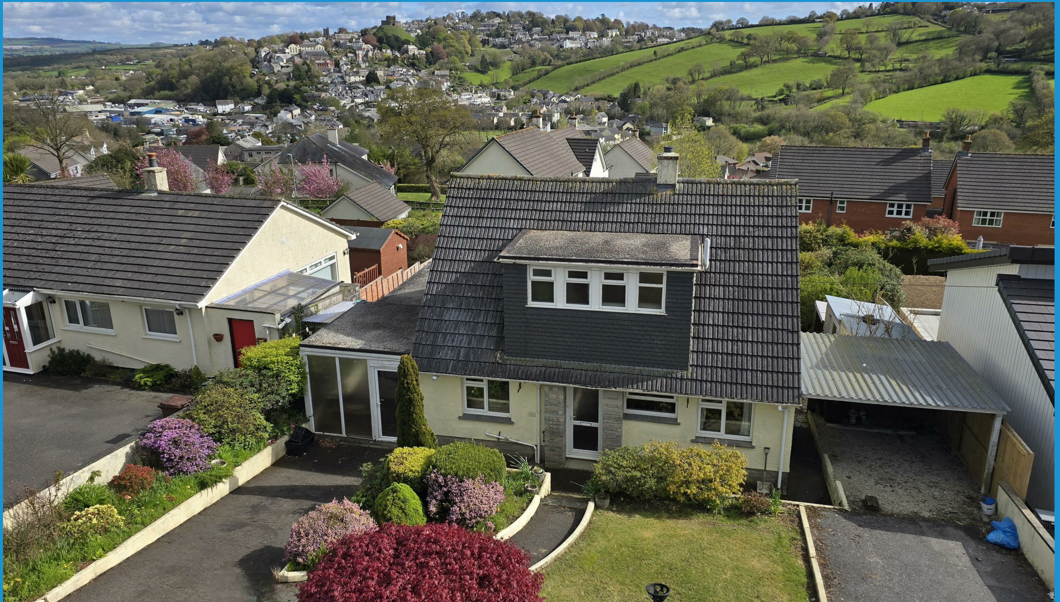
Clystene 12, Hollies Road Launceston | Cornwall