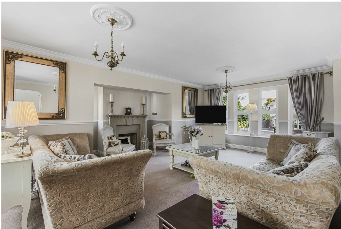
TV ROOM / BEDROOM 6: 13'4" x 10'5" (4.06m x 3.18m) Triple glazed windows to front, carpeted, with coving & pendant lighting to the ceiling.