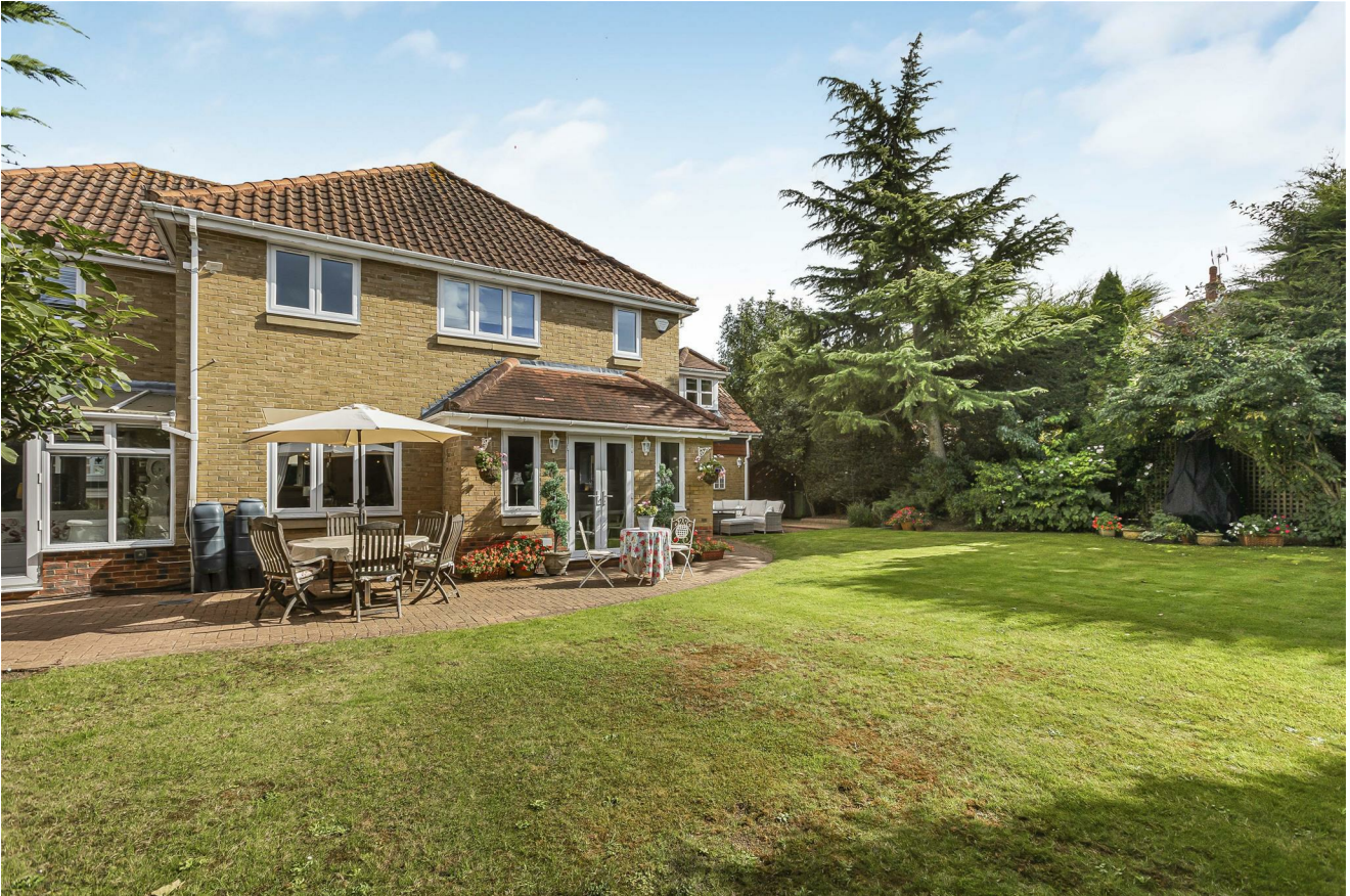
FRONT GARDEN: Mainly laid to lawn with mature trees and shrubs.