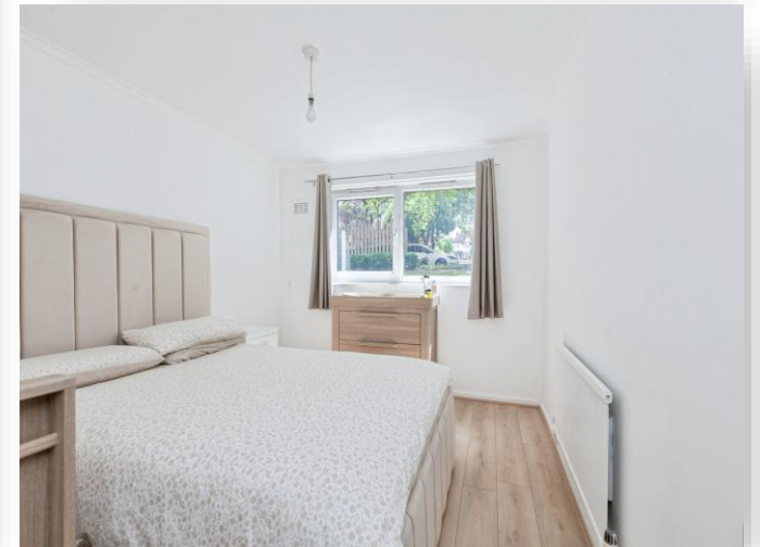
Park Hill Court Park Hill Drive, Leicester LE2 8HS