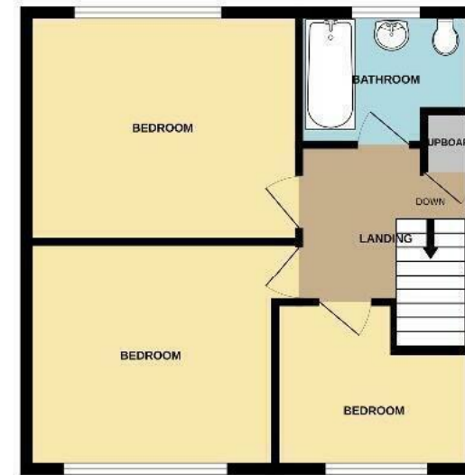
1ST FLOOR 479 sq.ft. (44.5 sq.m.) approx.