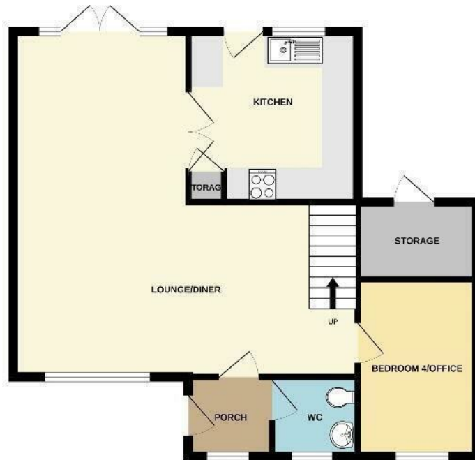
GROUND FLOOR 641 sq.ft. (59.5 sq.m.) approx.