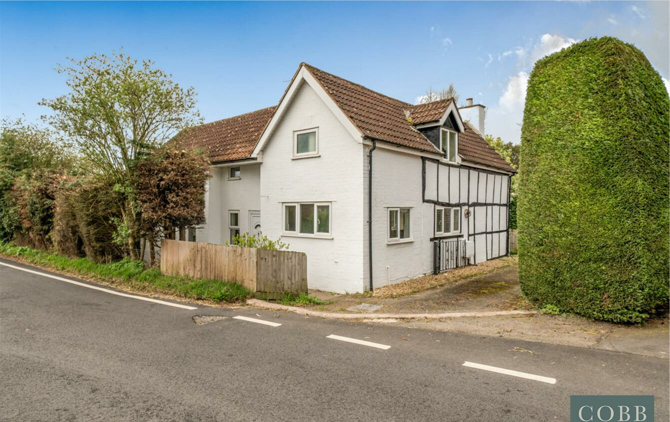
Whitehouse, Whitestone, Hereford, HR1 3SB Price £379,950