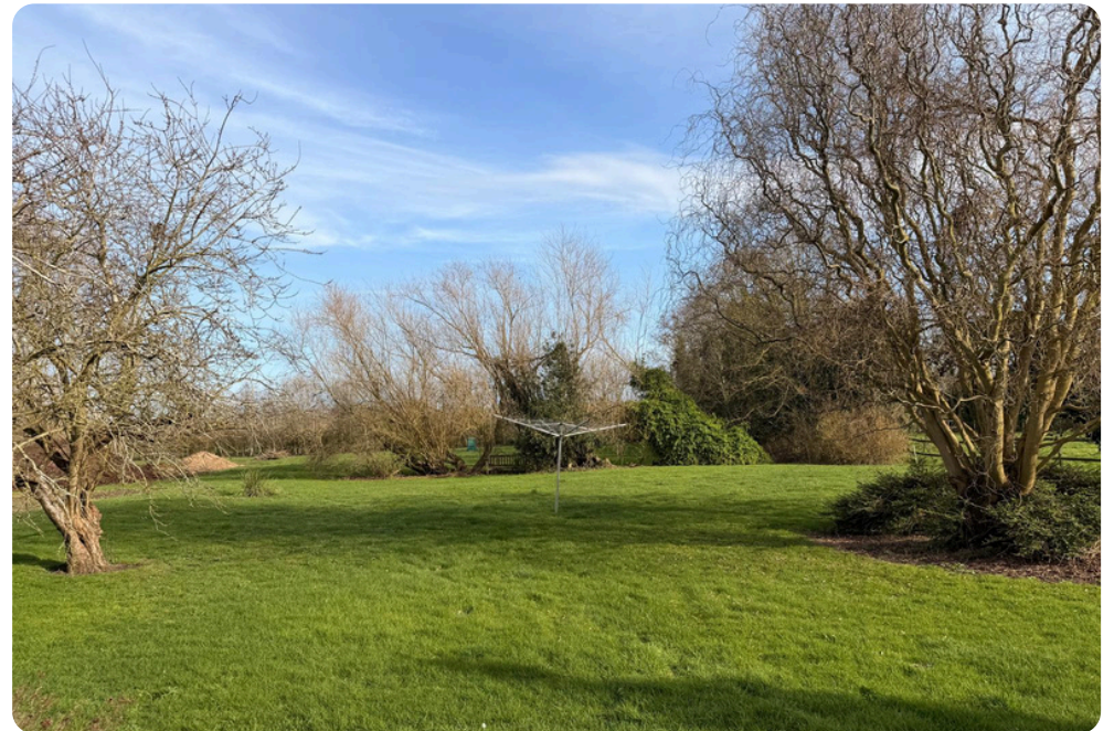
7 Myrtle House Farm, Terrington St John