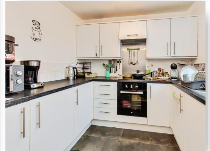
Samuel Place, Corby NN17 1BQ