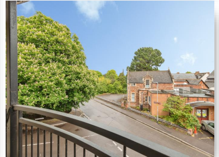
Carlton Court, Blenheim Road, Minehead, TA24 5PL