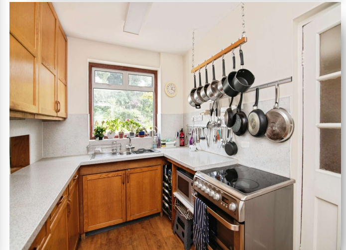
Medcroft Avenue, Birmingham B20 1NB