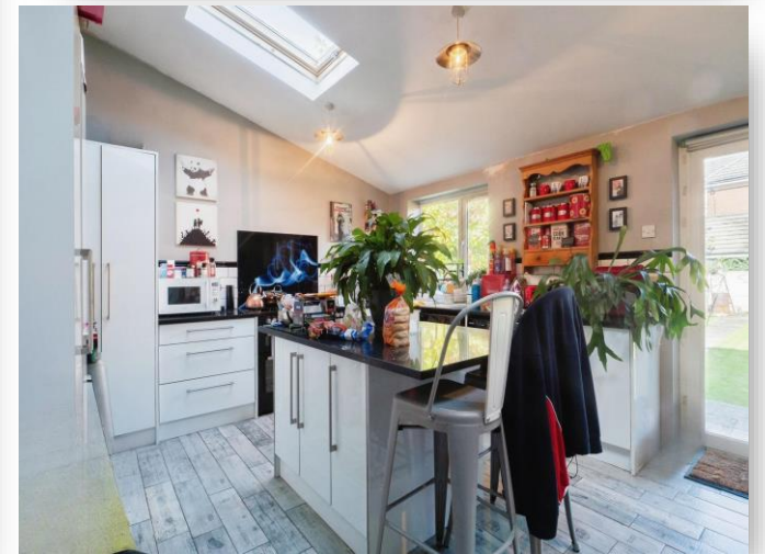
Bradgate Street, Leicester LE4 0AW