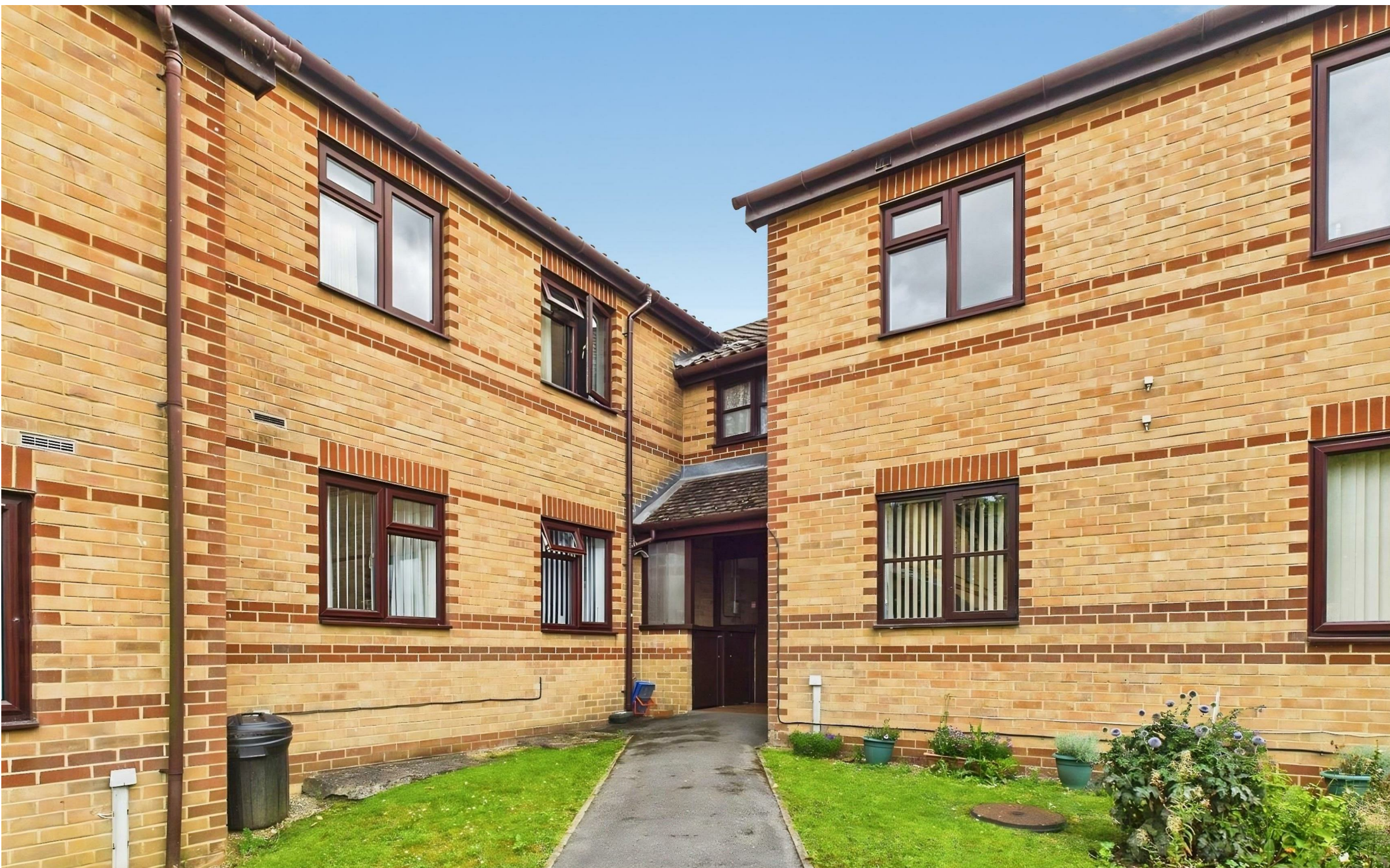
Gershwin Court, Brighton Hill, Basingstoke, RG22 4NN