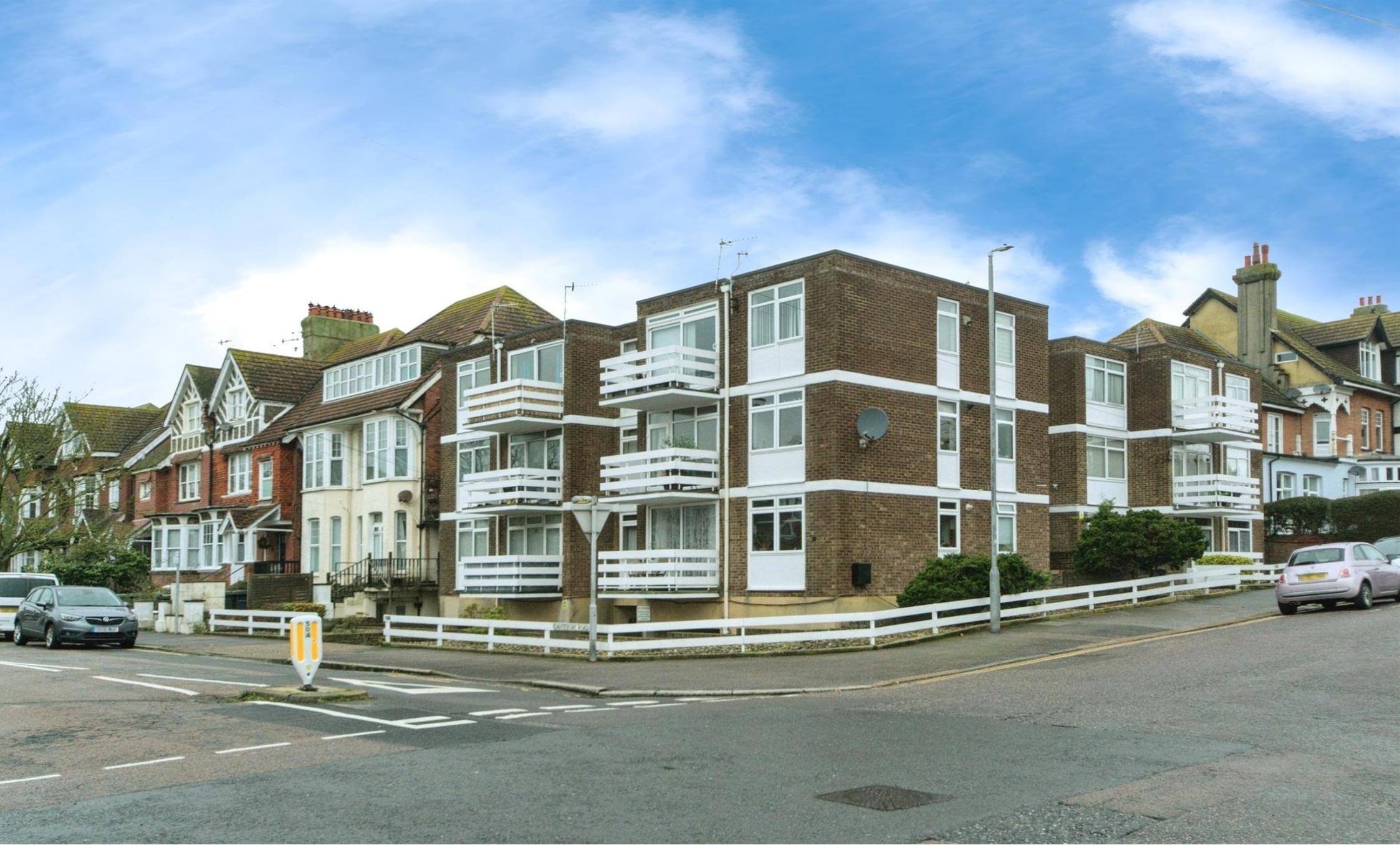
Dennis Morgan Court - Bolebrooke Road, Bexhill-On-Sea TN40 1ER