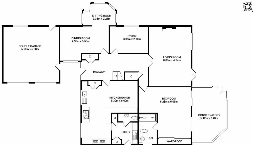
GROUND FLOOR APPROX. FLOOR AREA 191.9 SQ.M. (2044 SQ.FT.)