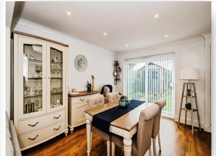
Priory Close, Sompting Lancing BN15 0EB