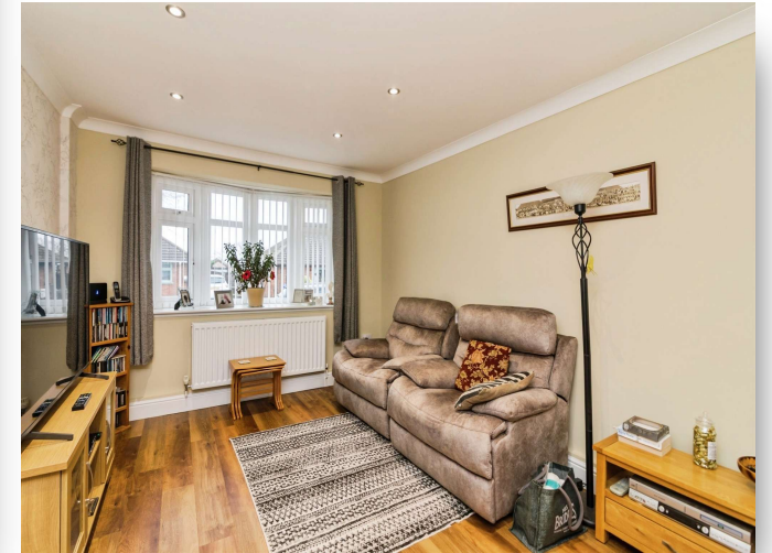
Highland Way, Lowestoft NR33 9AR