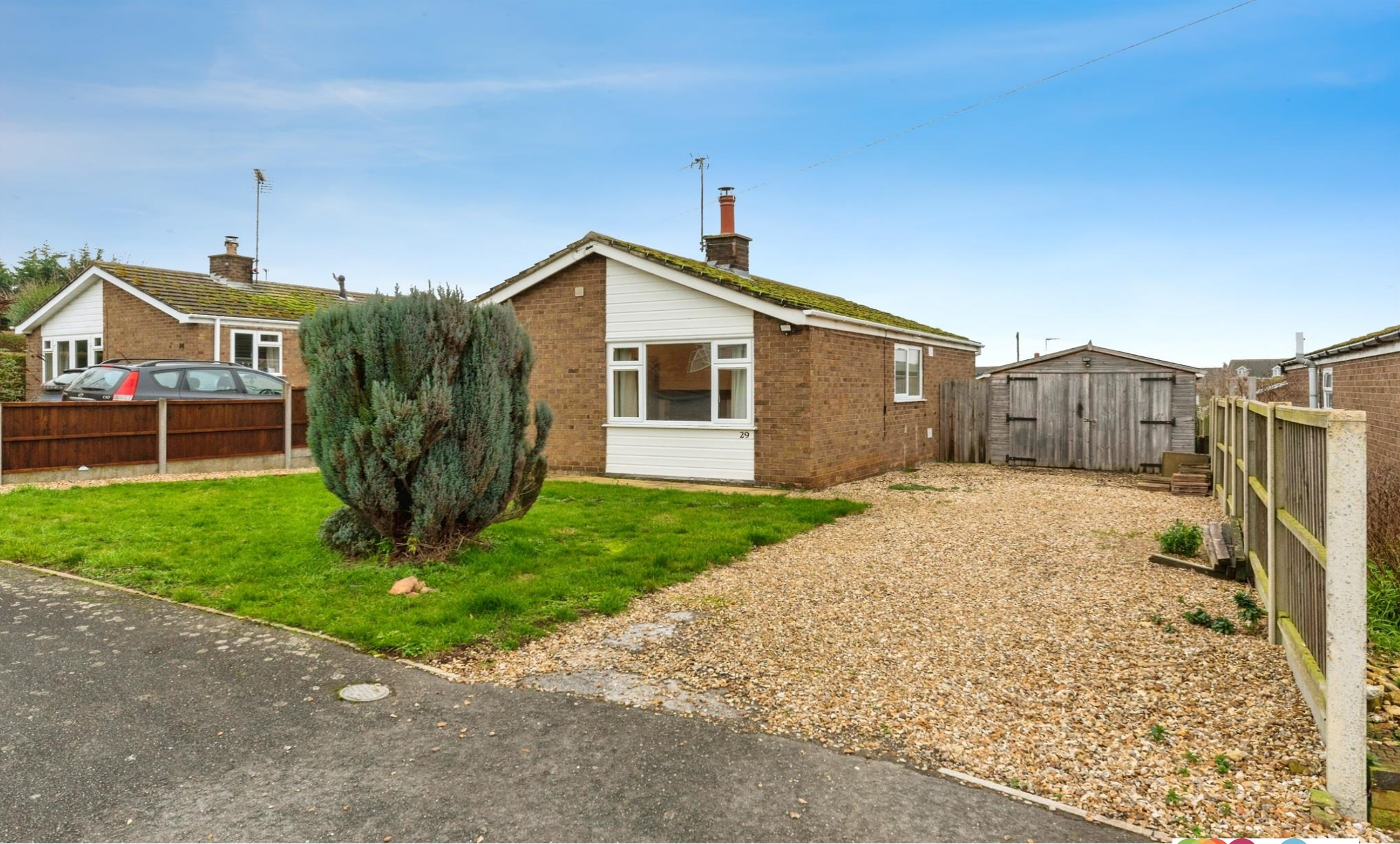
Brookside, Ancaster, Grantham NG32 3QT