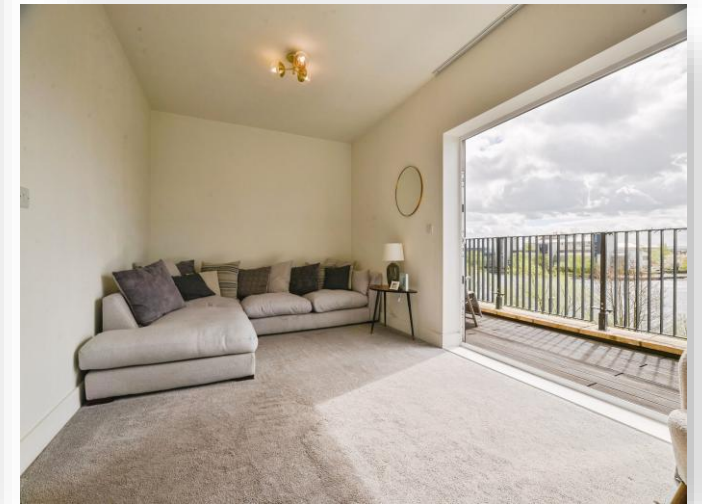
Infinity View, Stockton-On-Tees TS18 2FN