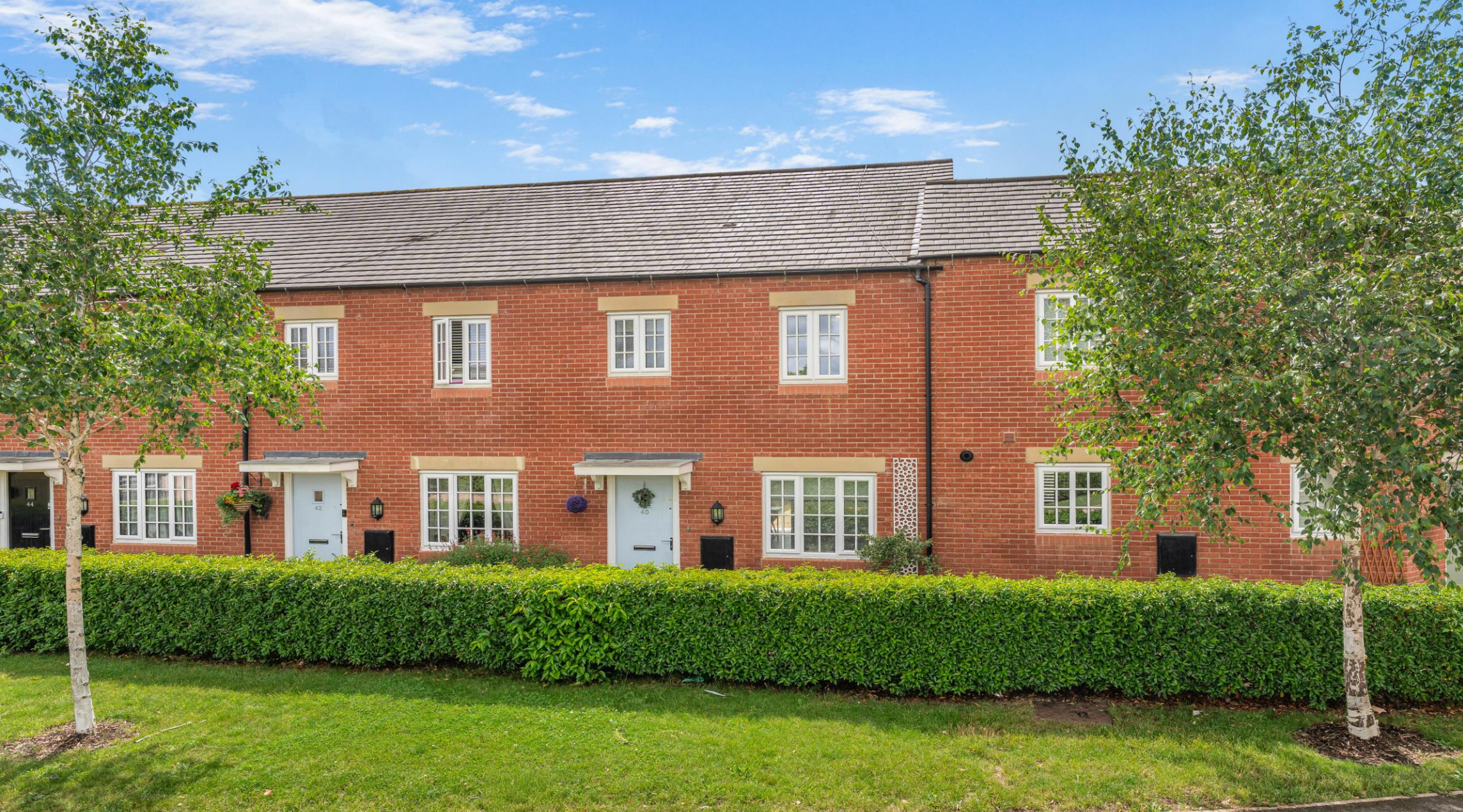
40 Parsons Piece Banbury, Oxon, OX16 9GW