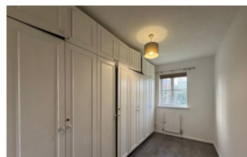
Turner Close , Wembley, Middlesex, HA0 2XT