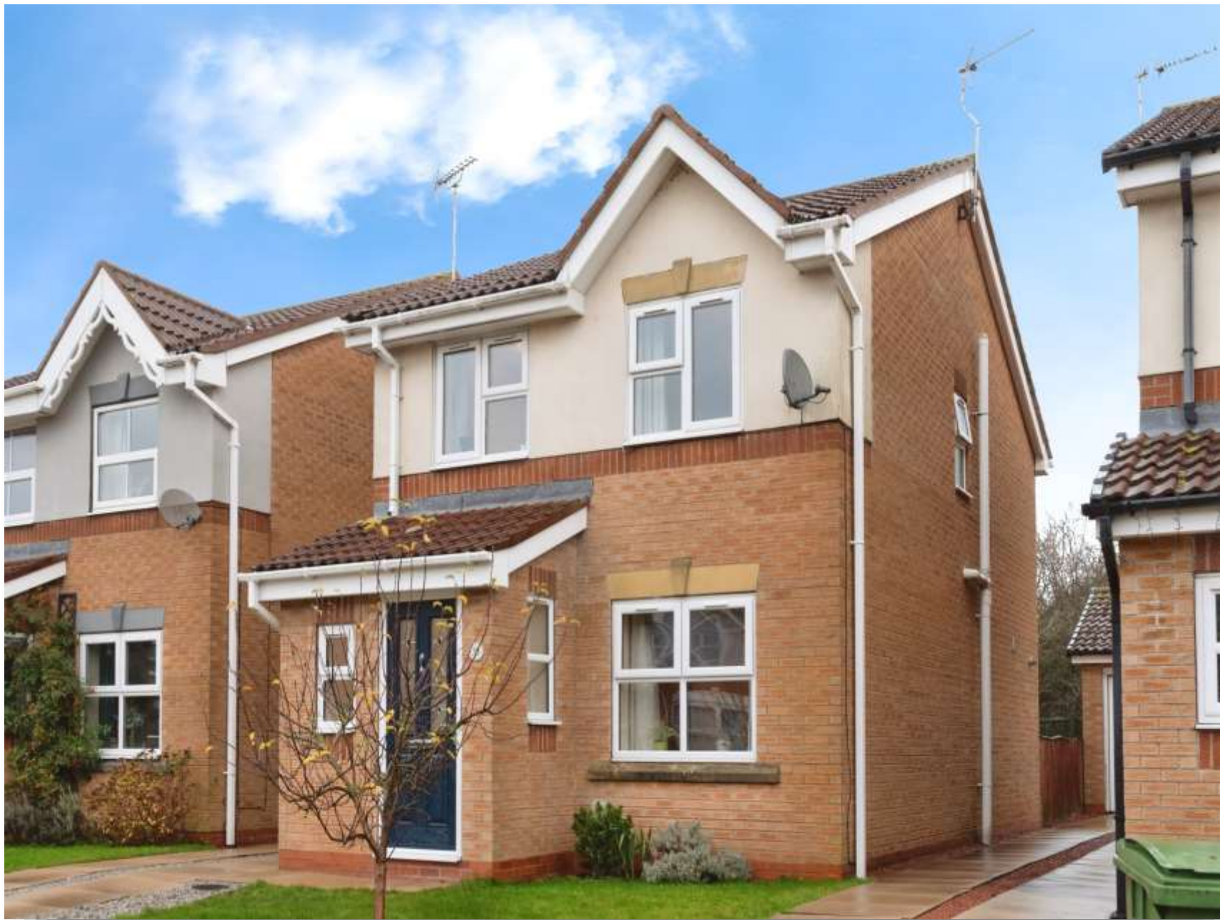
Butterfly Meadows, Beverley, HU17 9GA