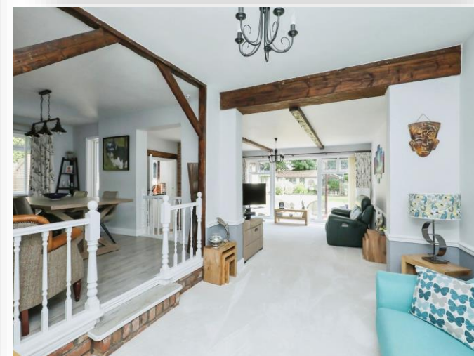
Cherry Tree Lodge High Street, Shipdham Thetford IP25 7PA