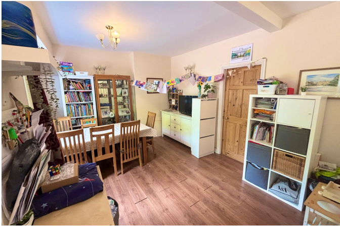
GROUND FLOOR 419 sq.ft. (38.9 sq.m.) approx.