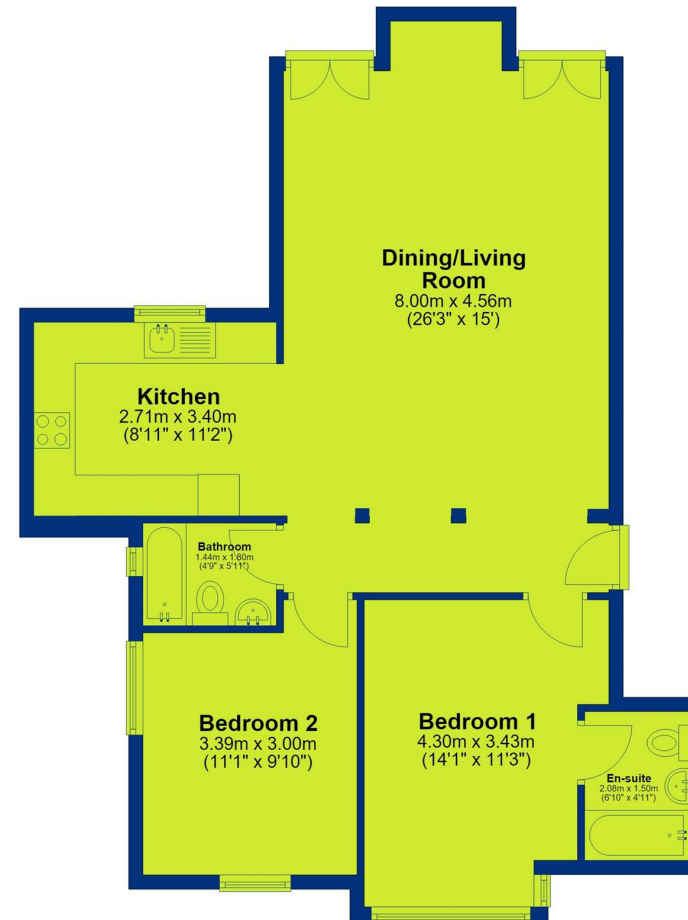
Total area: approx. 75.2 sq. metres (809.0 sq. feet)