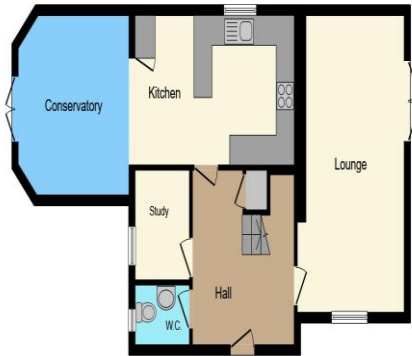
Ground Floor william h brown