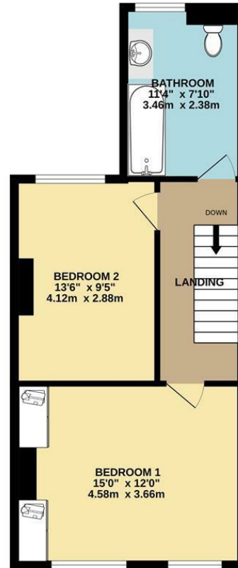
1ST FLOOR 462 sq.ft. (42.9 sq.m.) approx.