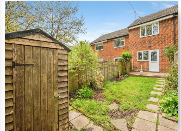
Oberon Close, Waterlooville PO7 8LF