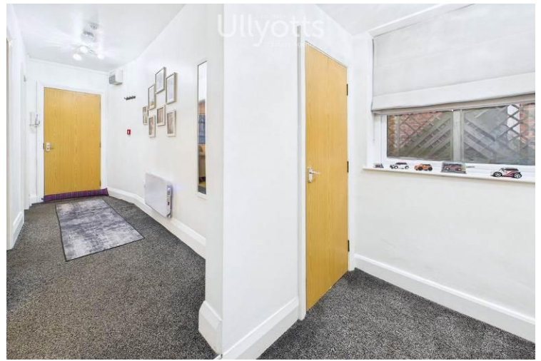
Entrance & Inner Hall