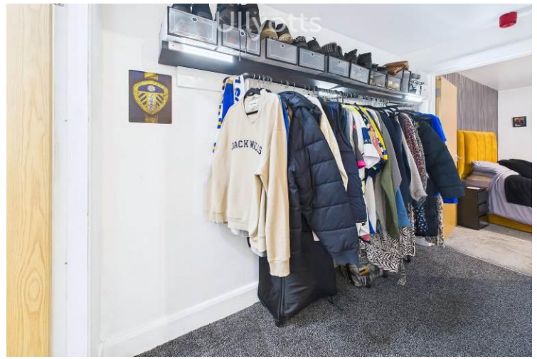
Walk Through Wardrobe