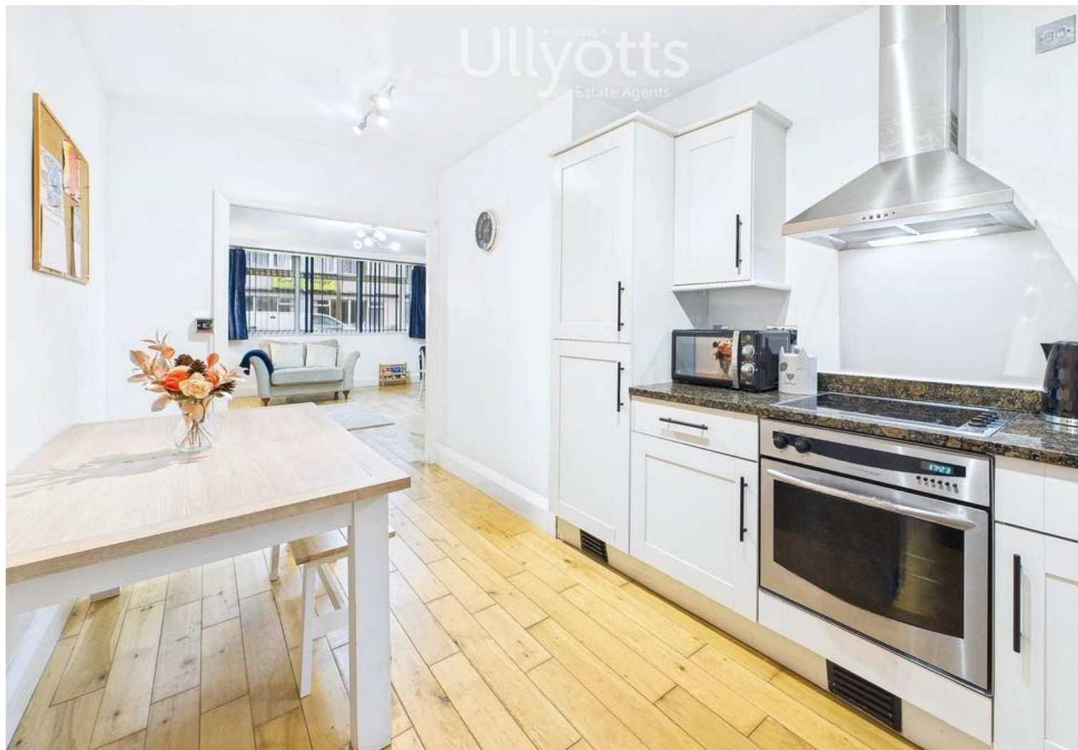
Kitchen Diner Open To Lounge