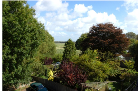
VIEW FROM BEDROOM 1