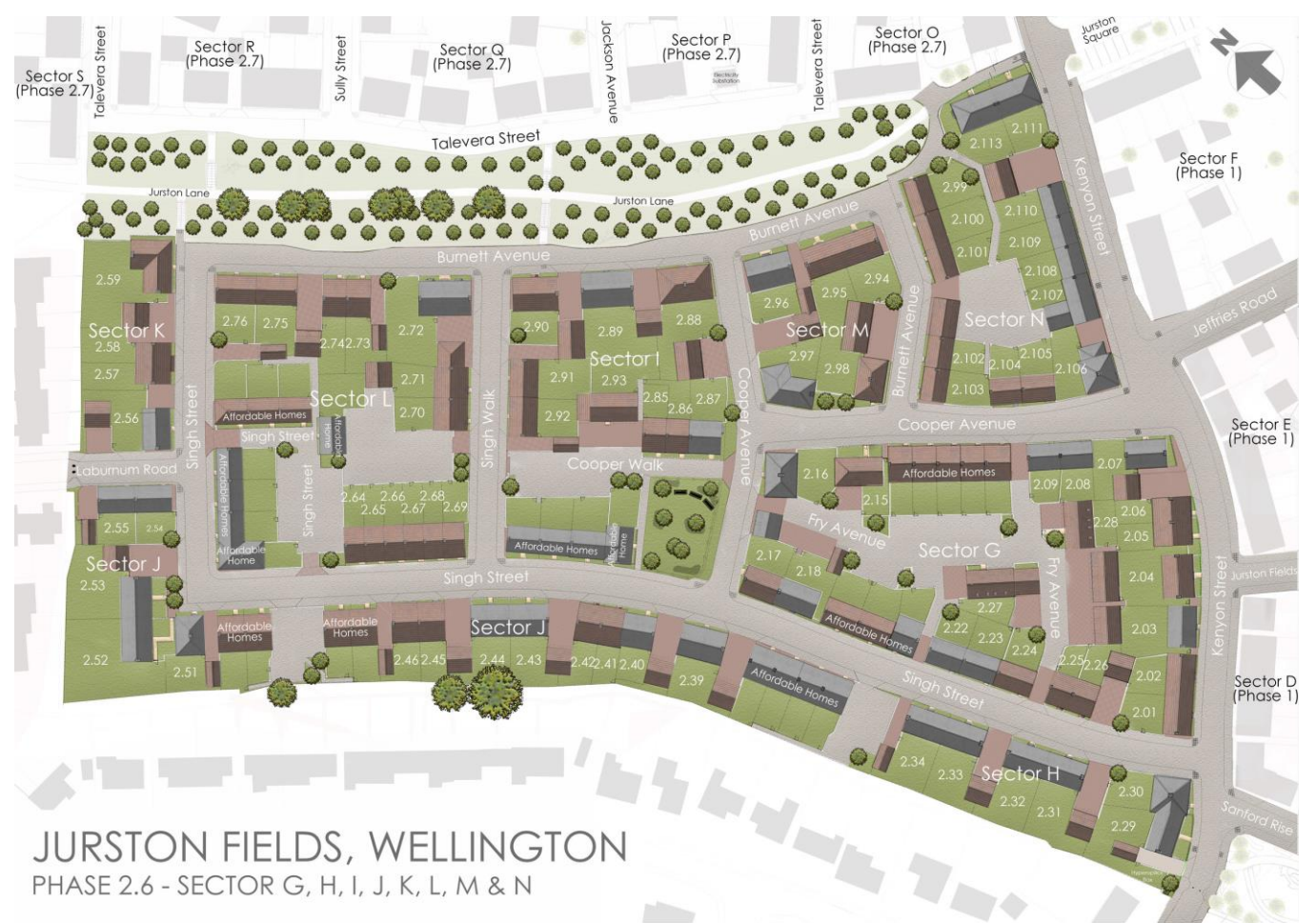
JURSTON FIELDS, WELLINGTON PHASE 2.6 - SECTOR G, H, I, J, K, L, M & N