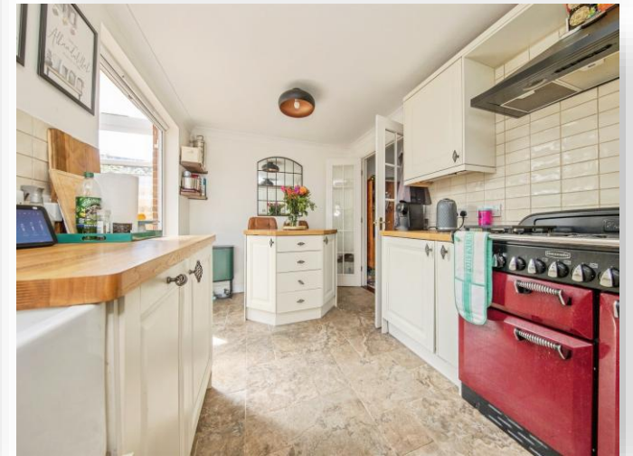
Oak Eggar Chase, Pinewood, Ipswich, IP8 3TE