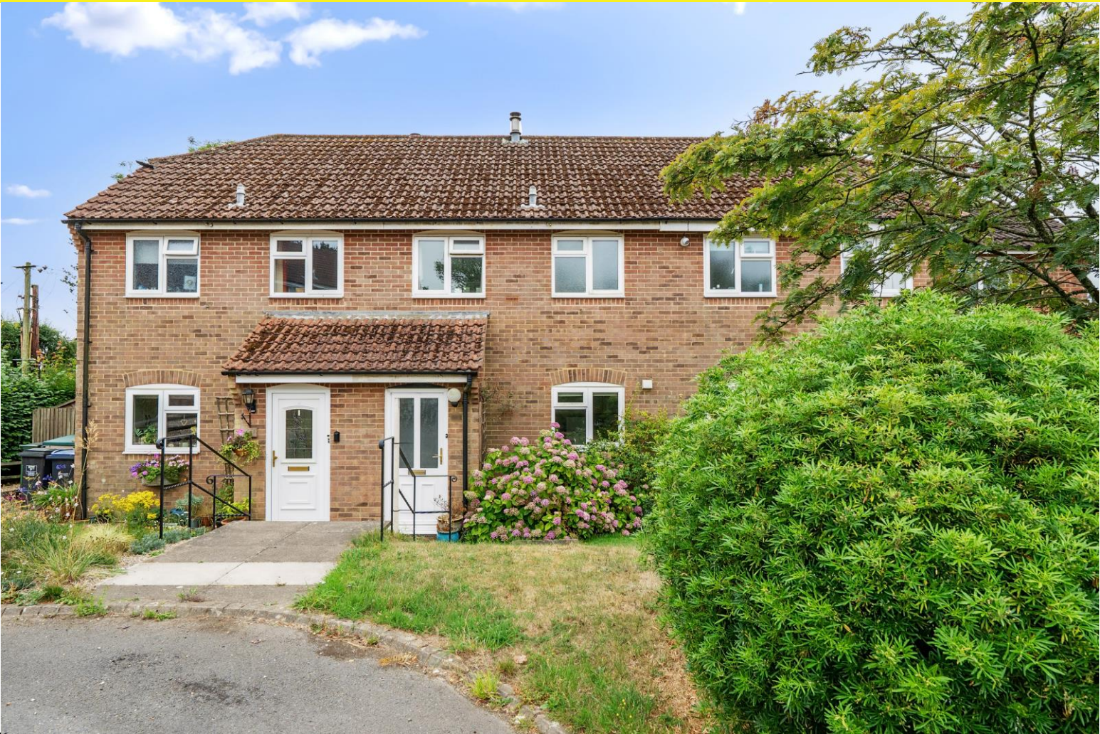
Tibb's Meadow, Upper Chute