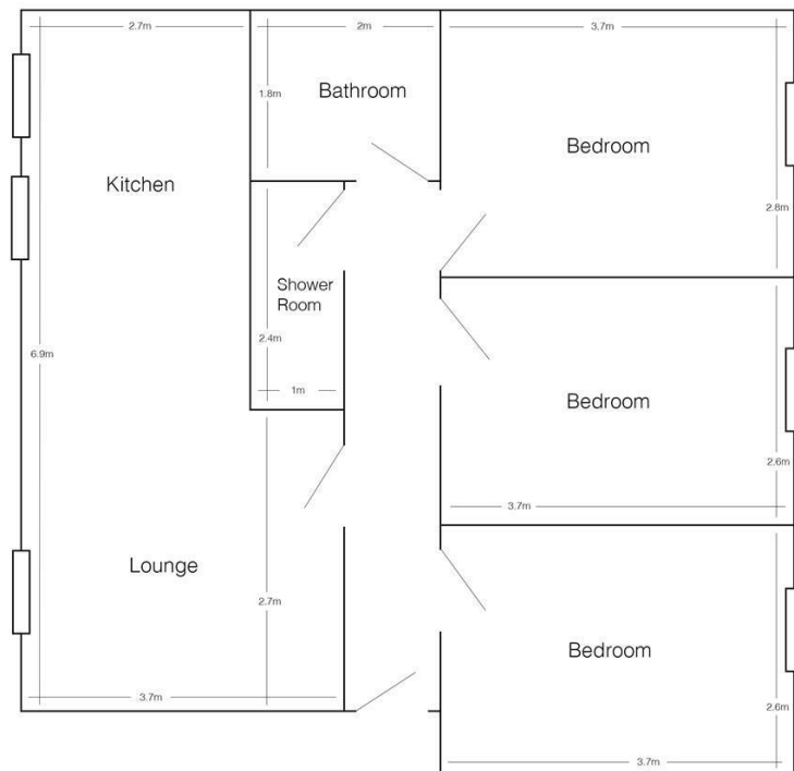
16 Headingley Rise (drawing not to scale)

Rent £110 per person week or £140 per person per week with bills included.