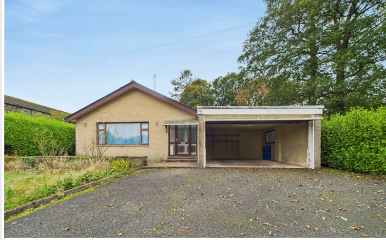
Mill Stream front External Drive and Garage

Anti- Money Laundering Regulations (AML) Please note that when an offer is accepted on a property, we must follow government legislation and carry out identification checks on all buyers under the Anti-Money Laundering Regulations (AML). We use a specialist third-party company to carry out these checks at a charge of £42.67 (inc. VAT) per individual or £36.19 (incl. vat) per individual, if more than one person is involved in the purchase (provided all individuals pay in one transaction). The charge is non-refundable, and you will be unable to proceed with the purchase of the property until these checks have been completed. In the event the property is being purchased in the name of a company, the charge will be £120 (incl. vat).