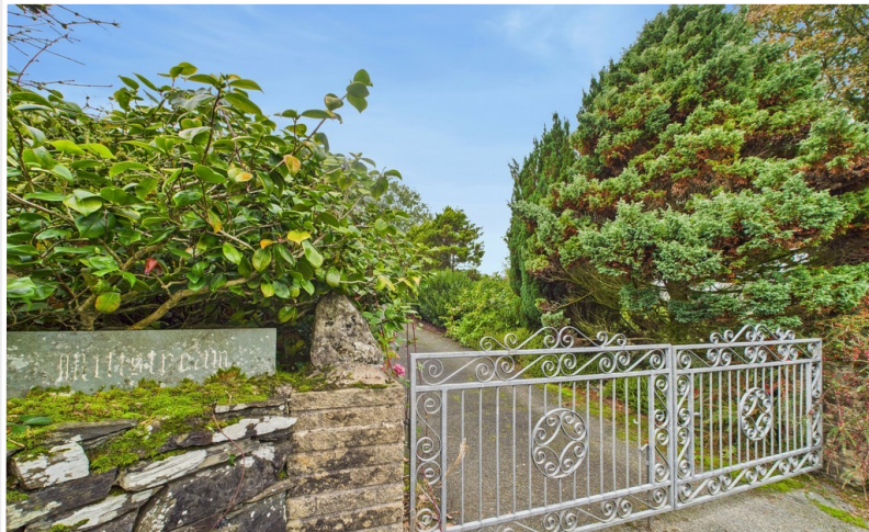
Mill Stream Entrance