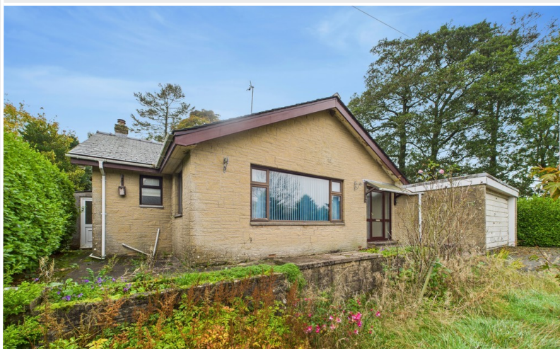
Mill Stream Front External