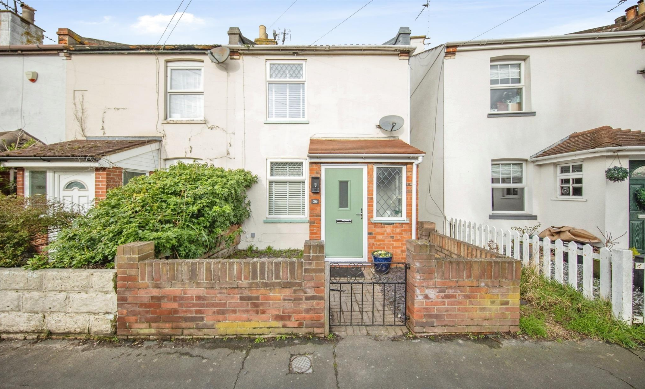
Alton Park Road, Clacton-On-Sea CO15 1ED