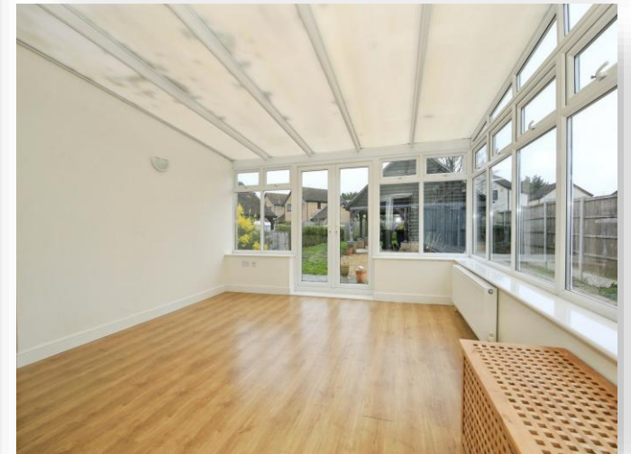
Ashbeach Drove, Ramsey Huntingdon PE26 2TG