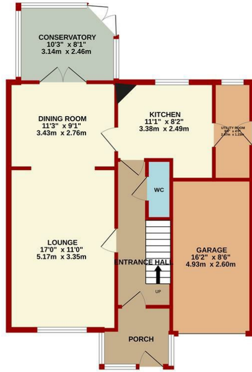
GROUND FLOOR 776 sq.ft. (72.1 sq.m.) approx.