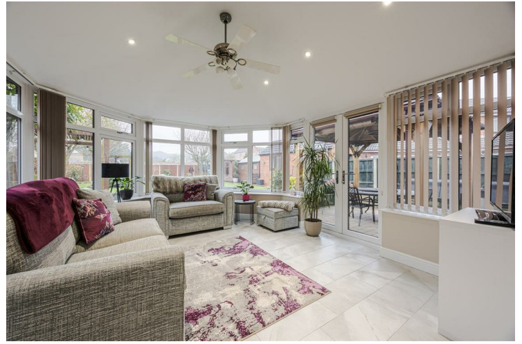
Sun room 14'1" x 12'3" (4.31 x 3.74)