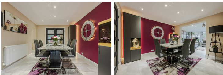
Dining room 11'7" x 10'2" (3.55 x 3.11)