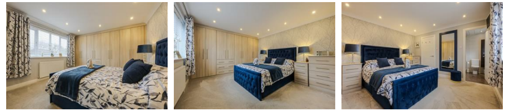
Bedroom one 13'8" x 11'11" (4.18 x 3.64 )