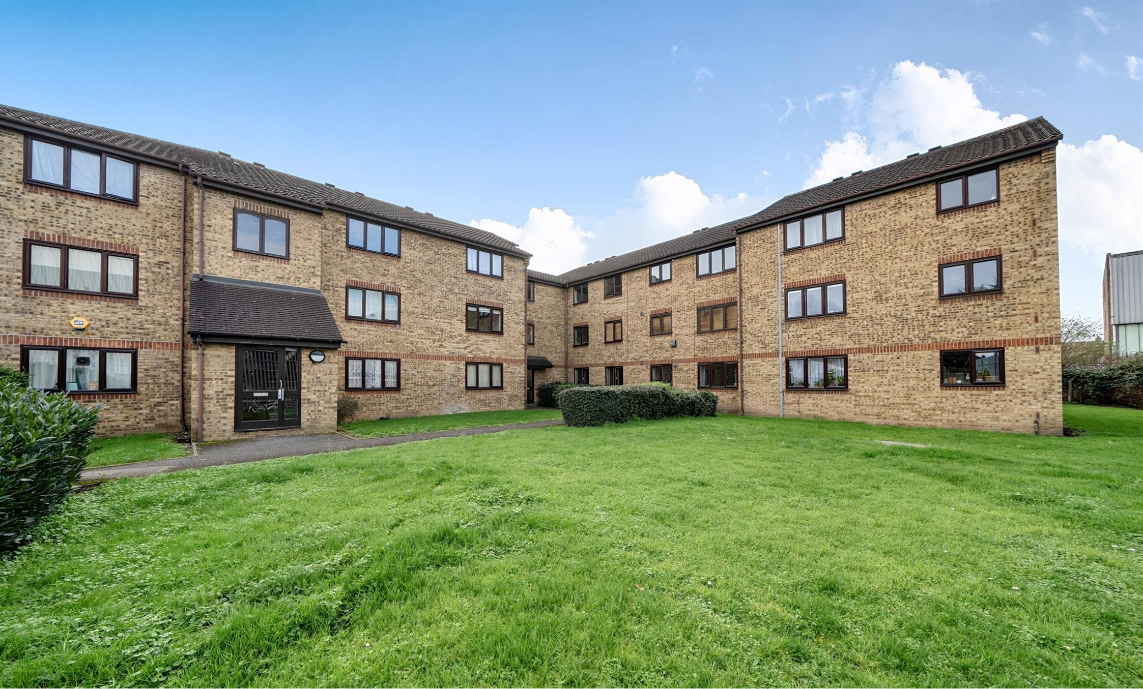
Bay Court, Popes Lane, London, W5 4NE