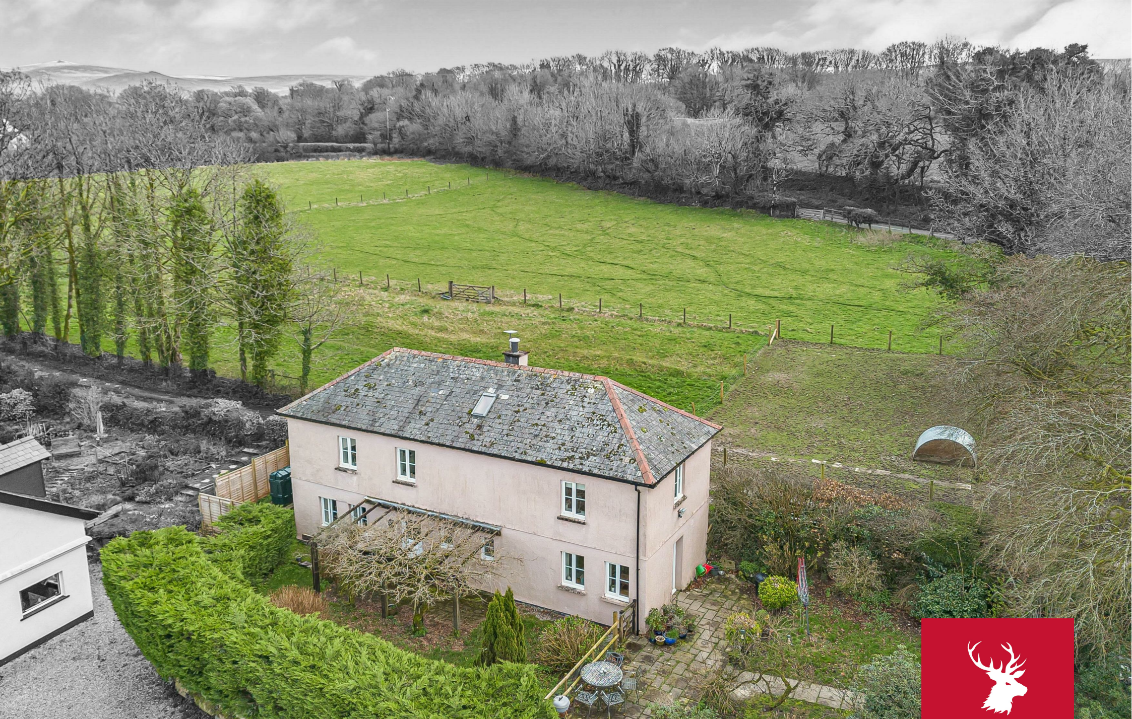
Holmeleigh Coach House